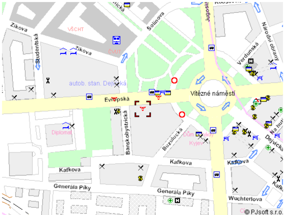
Map Nr. 2 – Tube Map