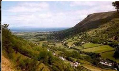
Glens of Antrim

More tourist information can be found at www.discovernorthernireland.com